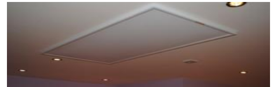
Ceiling Mounted Panel