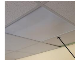
Ceiling Grid Panel